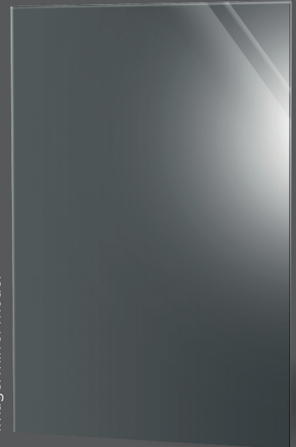
Image: mirror model